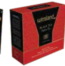
20 Pyramid Tea Bags