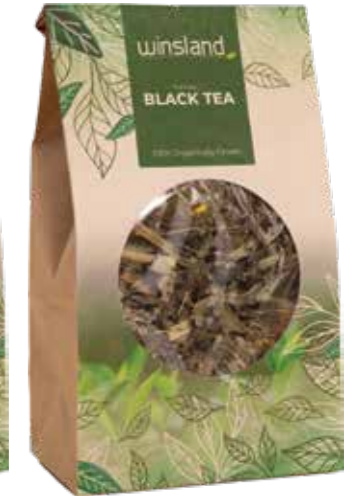
Organic Black Tea